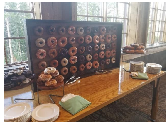
table-top wall with 50 pegs - great for donuts, hanging placecards, etc.